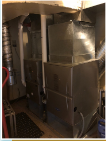
the new furnaces in the church