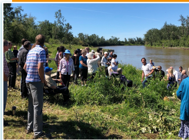
A part of the party down by the riverside!